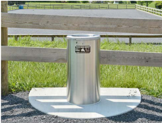
Stainless steel bowls can be found on pastures, in cowsheds and stables alike.