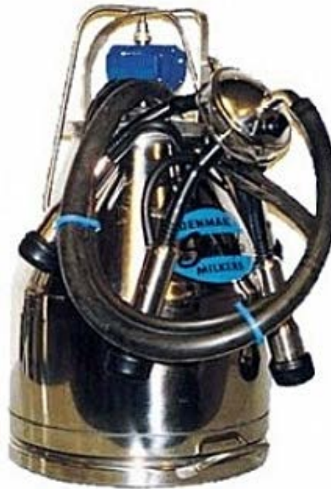
For small farms with only few cows, stainless steel bucket-top milkers are a practical solution.

be heated up further to 80-85 °C – the standard temperature for cleaning the milking system – or mixed with cold water for general cleaning purposes. During the year, the energy recovered from 1,000 litres of milk per day can save 13,100 kWh of electricity or 1,900 litres of oil.