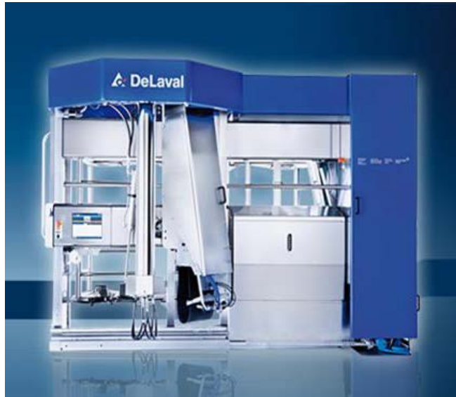
From buckets to high-tech milking equipment, stainless steel plays a role in agricultural applications.

In a robust farming environment mechanical damage is difficult to avoid. For this reason, intrinsically corrosion resistant materials like stainless steel have multiple advantages.