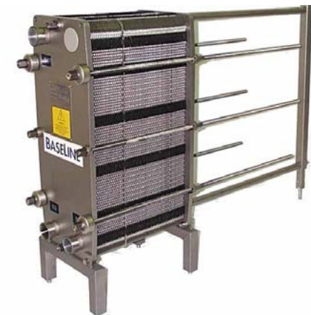
Milk cooling with integrated heat recovery ensures optimal raw milk quality and reduces the energy consumption of the dairy farm.